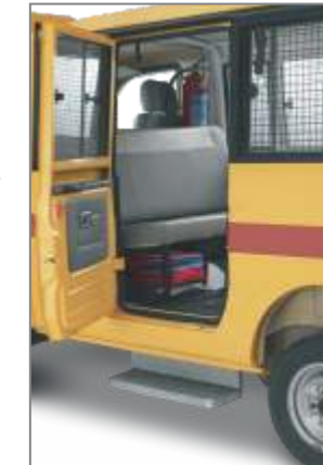
Racks Under Seats